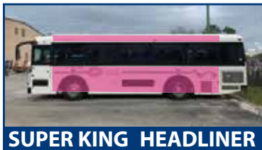
SUPER KING HEADLINER